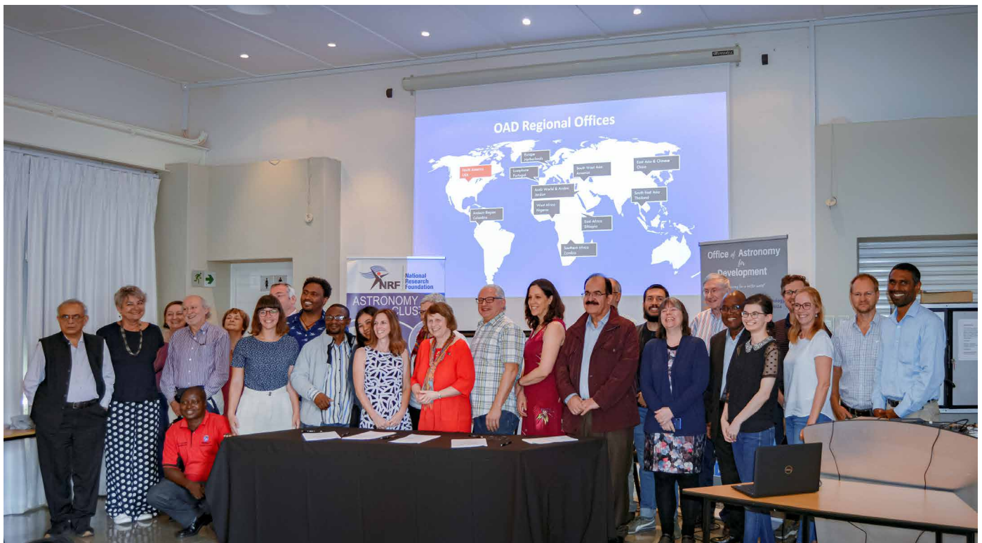
Image: Members of the OAD Steering Committee, representatives of the North American Regional Office consortium, representatives from other Regional Offices, staff from the IAU Offices.

More information in the IAU Press Announcement .